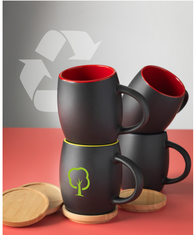
100466 HEARTH 400 ML CERAMIC MUG WITH WOODEN LID/COASTER