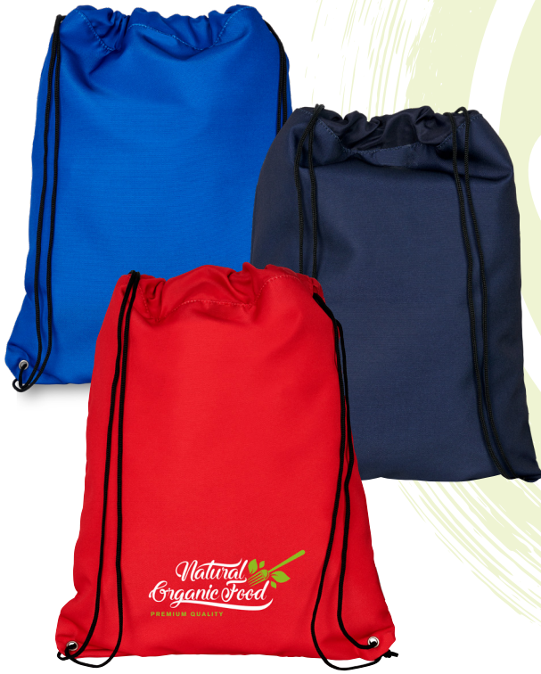
120461 ORIOLE RPET DRAWSTRING BAG