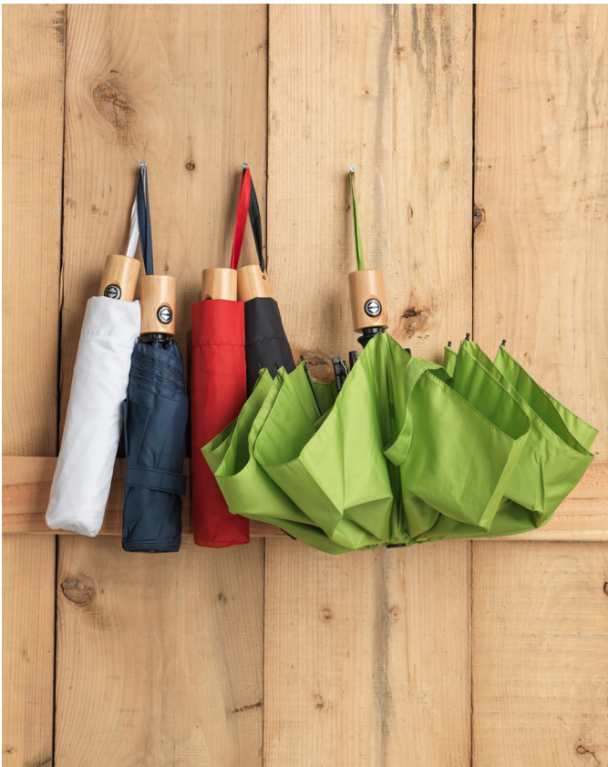
109143 RPET FOLDING UMBRELLA