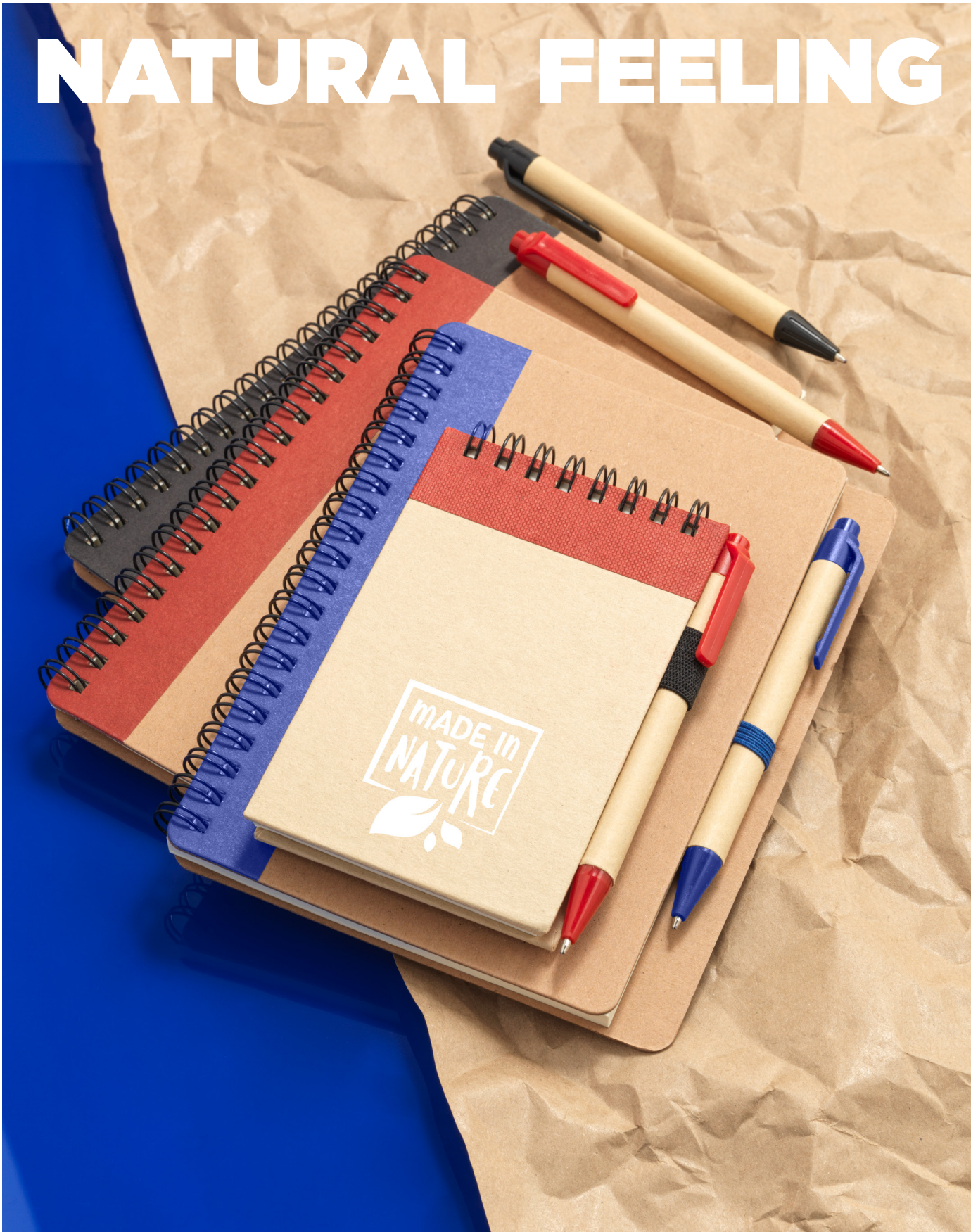
106268 PRIESTLY RECYCLED NOTEBOOK WITH PEN