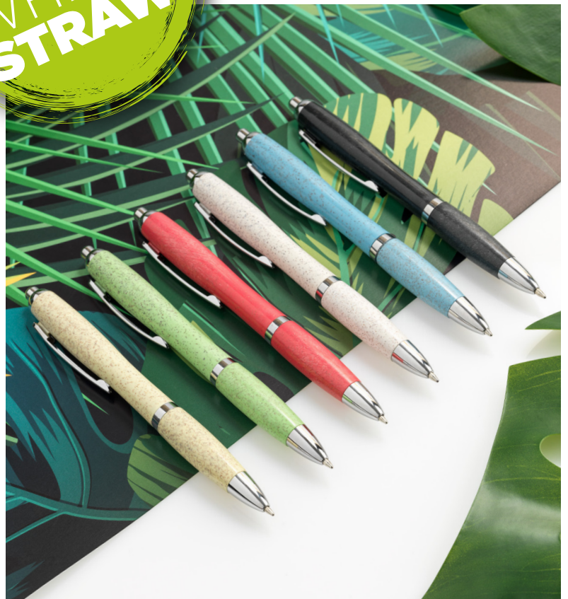
107379 NASH WHEAT STRAW CHROME TIP BALLPOINT PEN

WHEAT STRAW IS THE LEFT OVER STALK AFTER WHEAT GRAINS ARE HARVESTED, WHICH REDUCES THE AMOUNT OF PLASTIC USED BY AROUND 50%