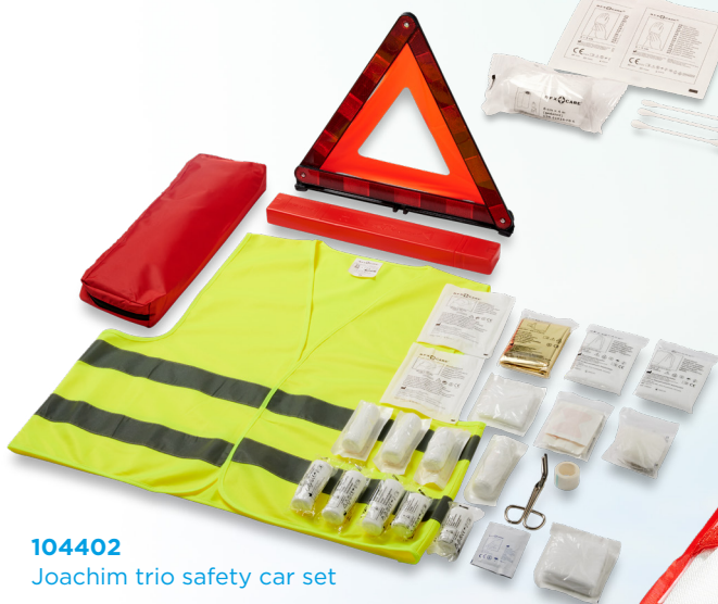
104402 Joachim trio safety car set