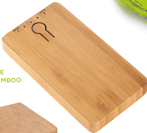
123676 GROVE 5000 MAH BAMBOO POWER BANK