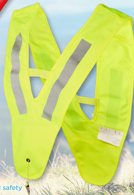
122015 Nikolai v-shaped safety vest for kids