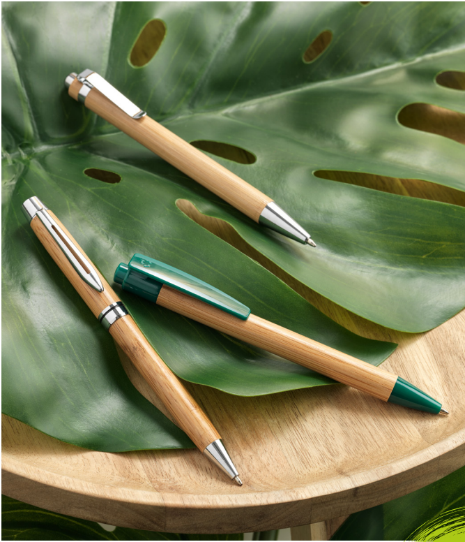
106282 JAKARTA BAMBOO PEN 106322 BORNEO BAMBOO PEN 106212 CELUK BAMBOO BALLPOINT PEN