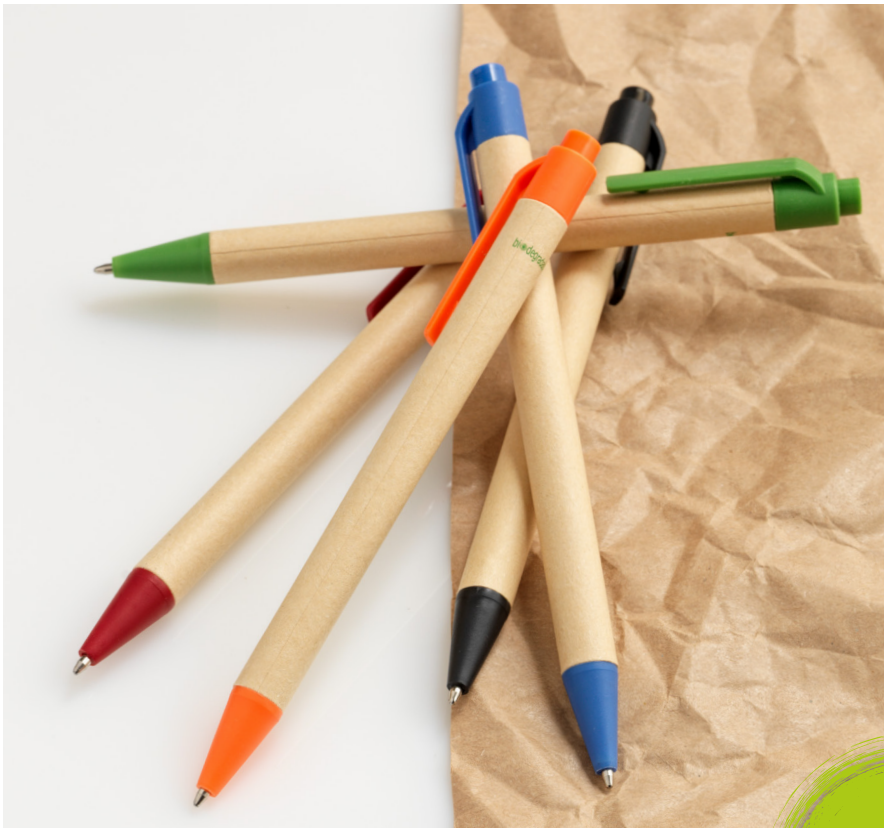
107384 BERKAN RECYCLED CARTON AND CORN BALLPOINT PEN