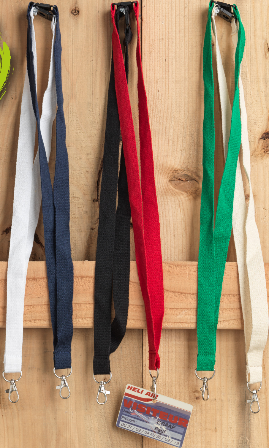
102512 DYLAN COTTON LANYARD WITH SAFETY CLIP