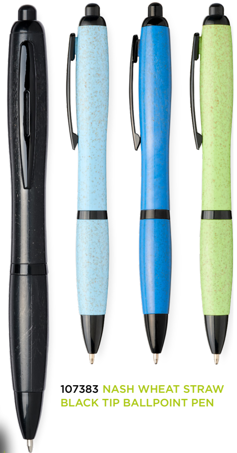
107383 NASH WHEAT STRAW BLACK TIP BALLPOINT PEN