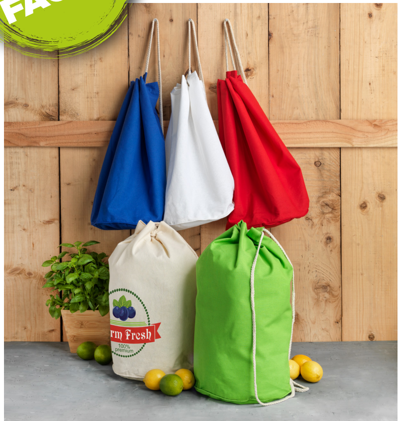
120111 MISSOURI COTTON SAILOR BAG

ROUGHLY 1.6 POUNDS OF OTHER USEFUL PRODUCTS BEING CREATED