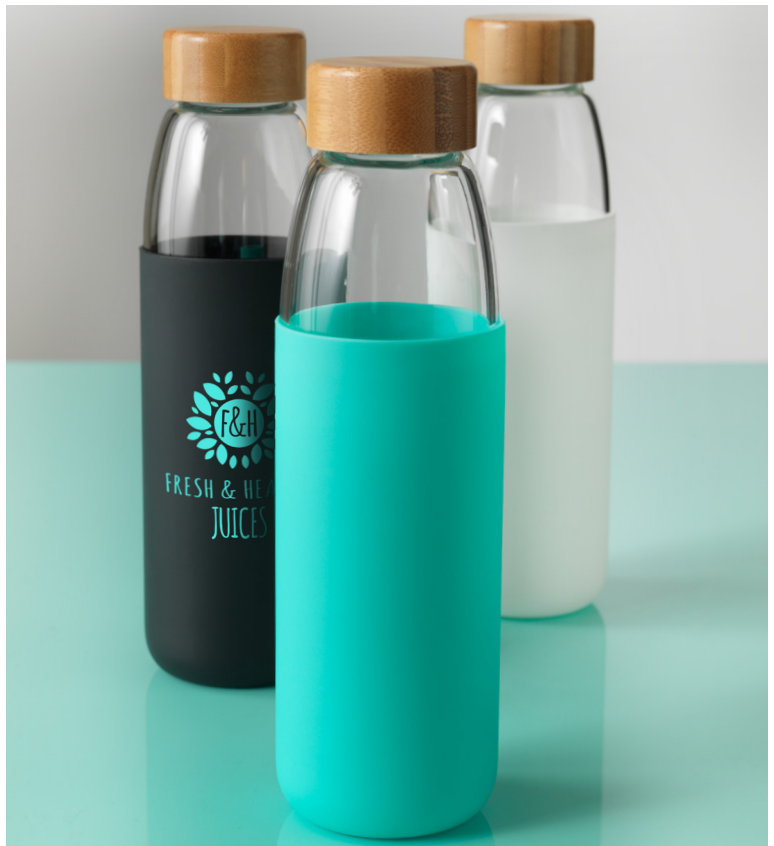
100550 KAI 540 ML GLASS SPORT BOTTLE WITH WOOD LID