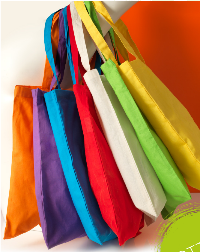
120181 MADRAS 140 G/M 2 COTTON TOTE