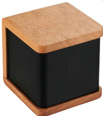
108304 SENECA WOODEN BLUETOOTH® SPEAKER