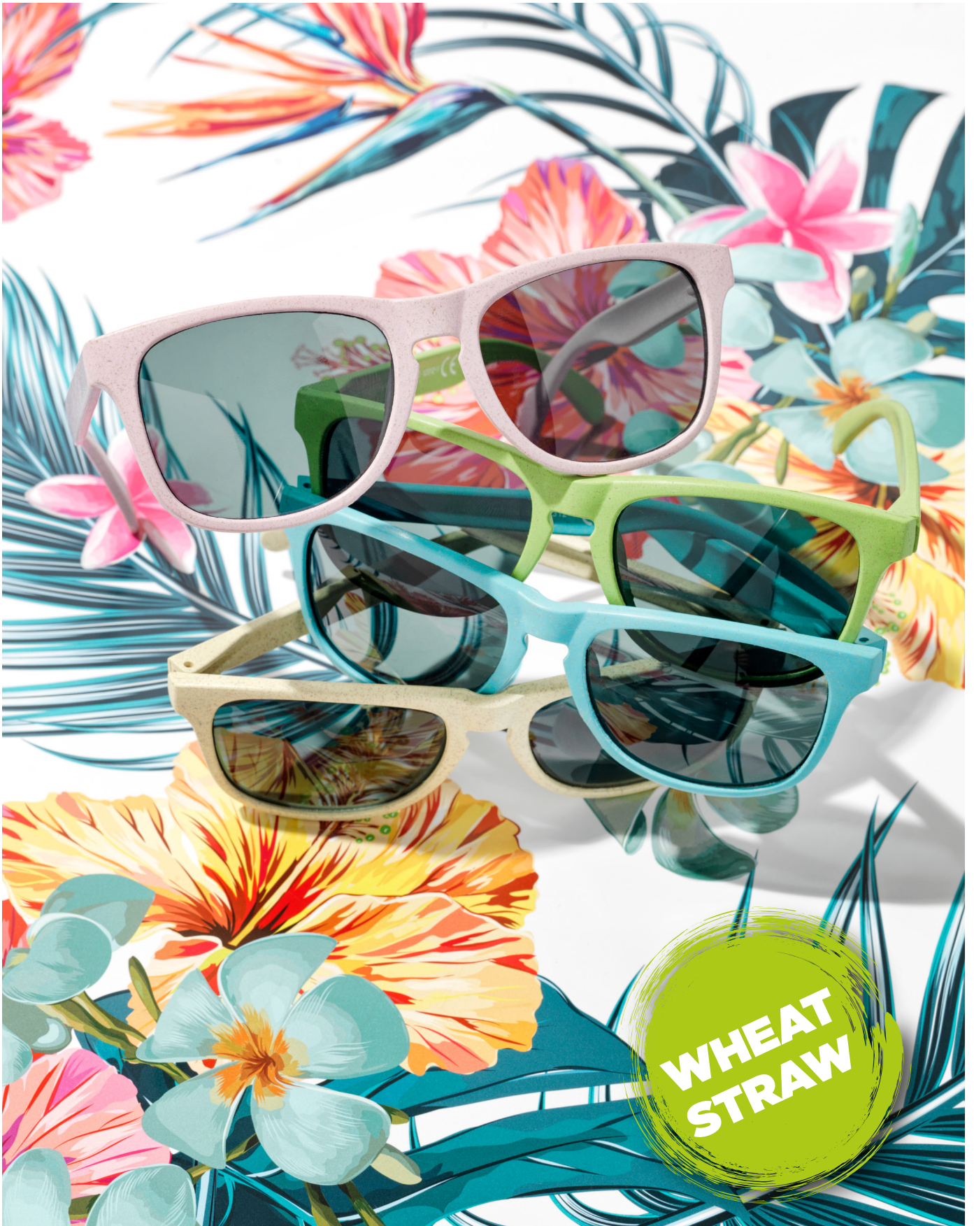
101001 RONGO WHEAT STRAW SUNGLASSES