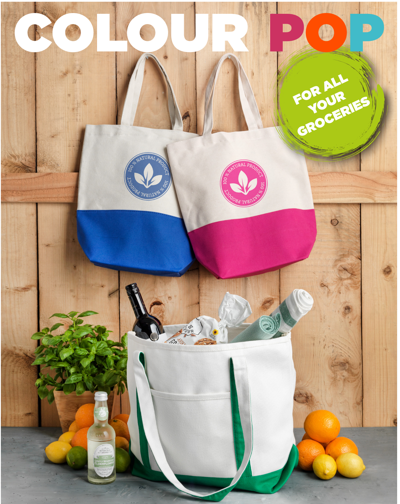
120258 COLOUR POP 284 G/M 2 COTTON TOTE