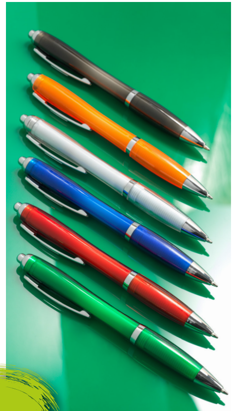
107377 NASH RECYCLED PET BALLPOINT PEN