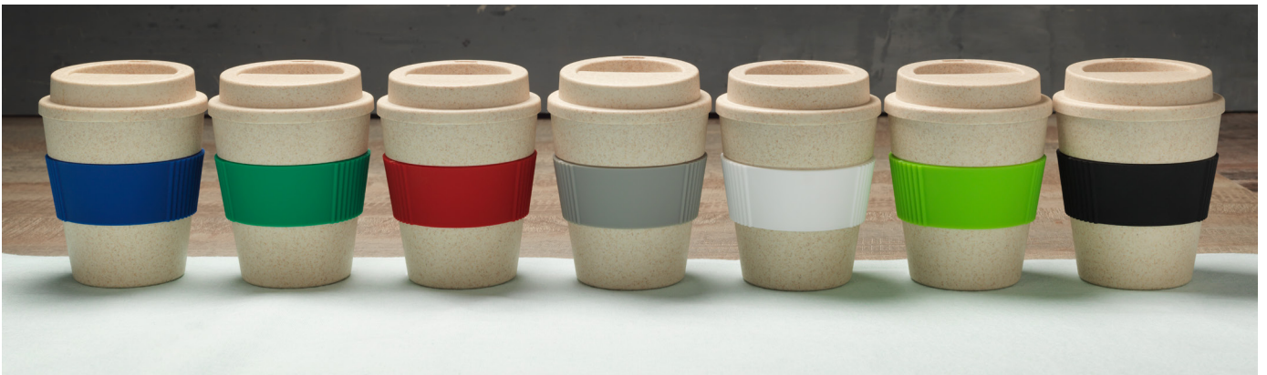
100576 OKA 350ML WHEAT STRAW TUMBLER