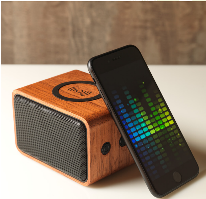
124007 WOODEN BLUETOOTH® SPEAKER WITH WIRELESS CHARGING PAD