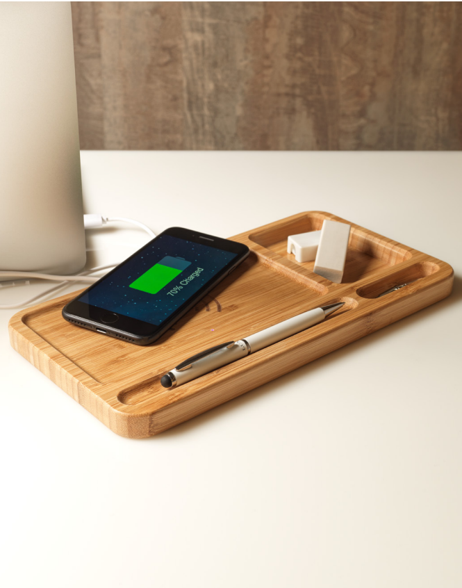
124102 FRAME WIRELESS CHARGING DESK ORGANISER