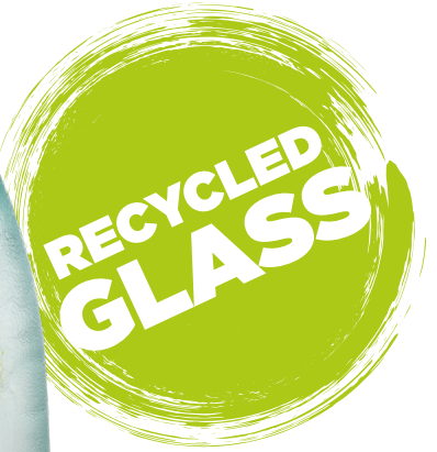
112691 RECYCLED CARAFE