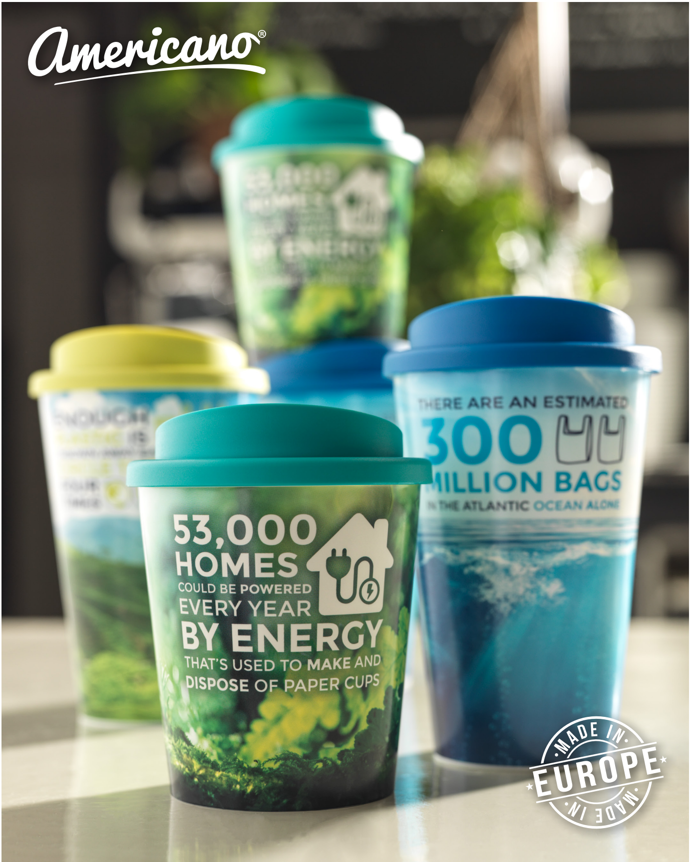
210091 BRITE-AMERICANO ® ESPRESSO 250ML INSULATED TUMBLER