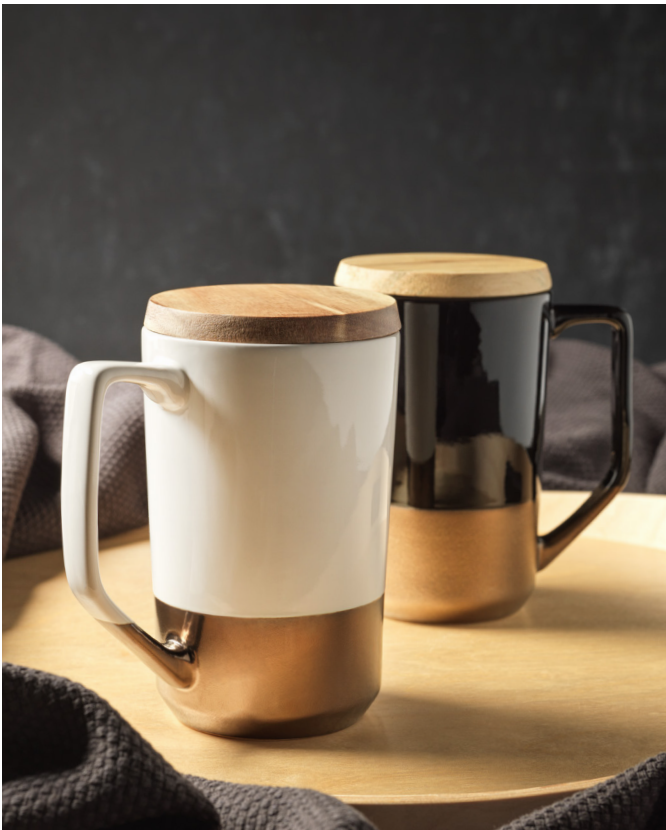
100537 TAHOE 470 ML CERAMIC MUG WITH WOODEN LID