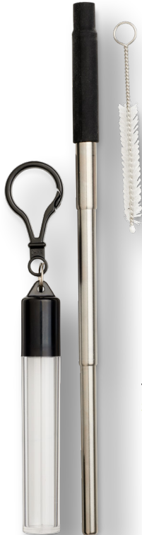
100586 ZEYA REUSABLE STAINLESS STEEL STRAW KEYCHAIN

MOST GLASS IS 100% RECYCLABLE AND CAN BE RECYCLED ENDLESSLY WITHOUT LOSS IN QUALITY OR PURITY