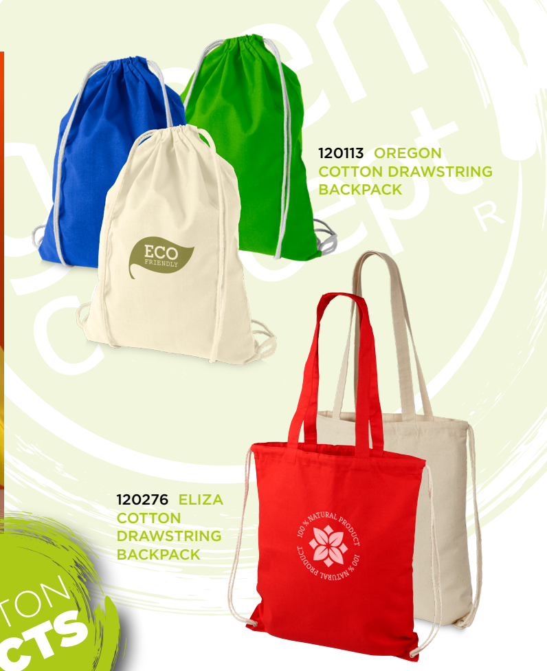
120113 OREGON COTTON DRAWSTRING BACKPACK