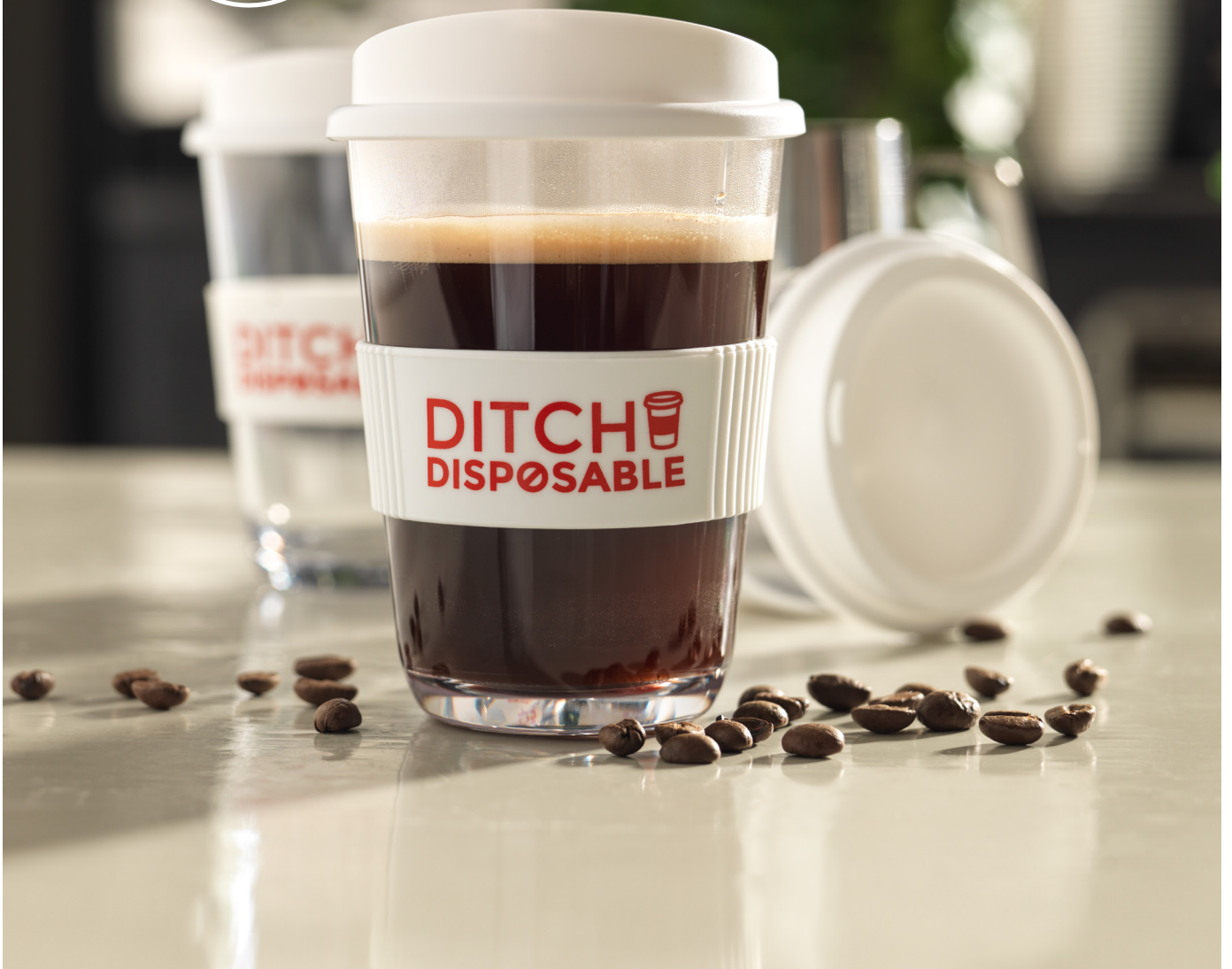
210090 AMERICANO® CORTADO 300 ML TUMBLER WITH GRIP