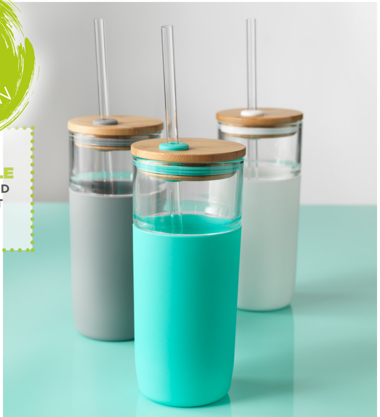
100486 ARLO 600 ML GLASS TUMBLER WITH BAMBOO LID