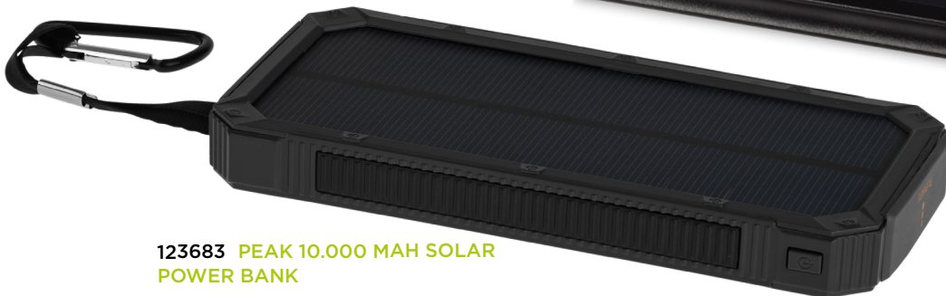
123683 PEAK 10.000 MAH SOLAR POWER BANK