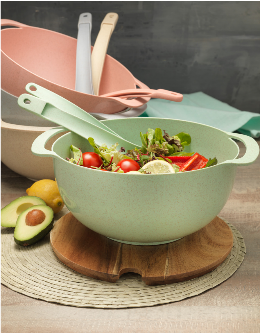
112993 LUCHA WHEAT STRAW SALAD BOWL WITH SERVERS