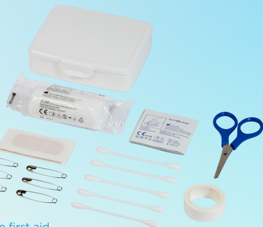
122007 Frederik 24-piece first aid plastic case