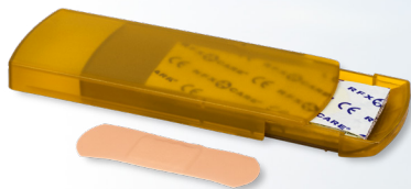
122004 Christian 5-piece plaster box