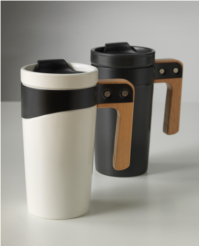
100430 GROTTO 475 ML CERAMIC MUG