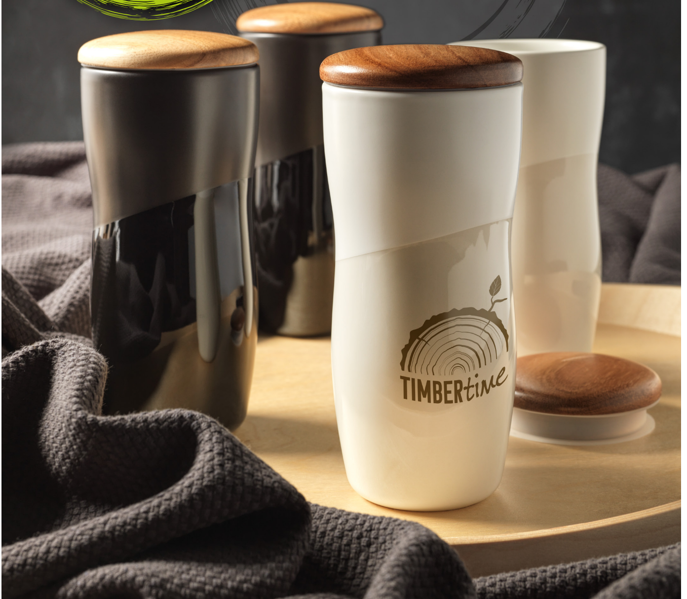
100592 RENO 370 ML DOUBLE-WALLED CERAMIC TUMBLER