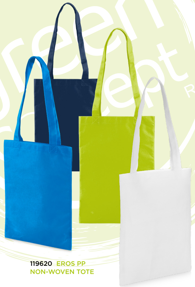
119620 EROS PP NON-WOVEN TOTE