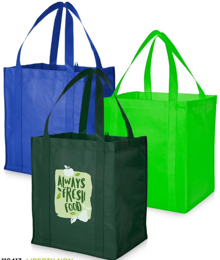
119413 LIBERTY NON WOVEN TOTE