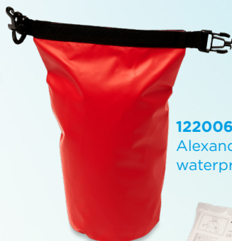
122006 Alexander 30-piece first aid waterproof bag