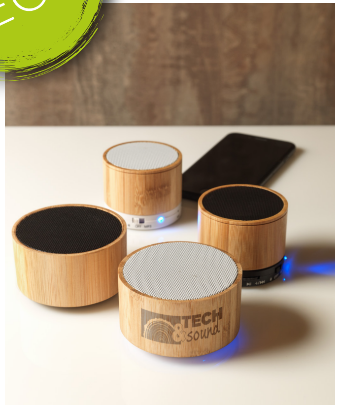
124100 COSMOS BAMBOO BLUETOOTH® SPEAKER 124101 EARTH BAMBOO BLUETOOTH® SPEAKER