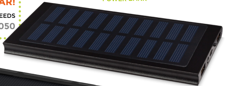
123688 STELLAR 8000MAH SOLAR POWER BANK

THE WHOLE WORLD COULD GET ALL THE POWER IT NEEDS FROM RENEWABLE RESOURCES BY 2050