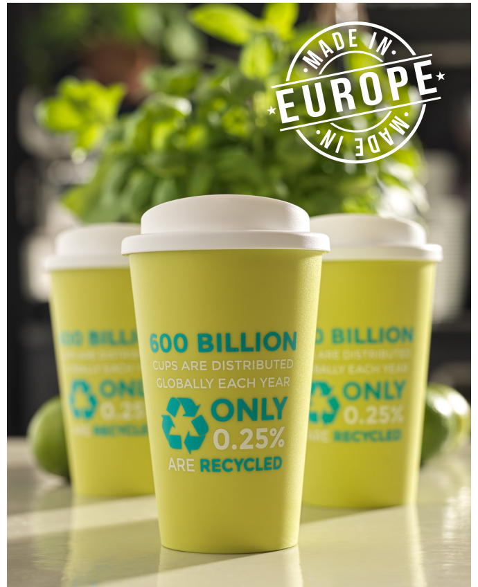
210001 AMERICANO® 350 ML INSULATED TUMBLER