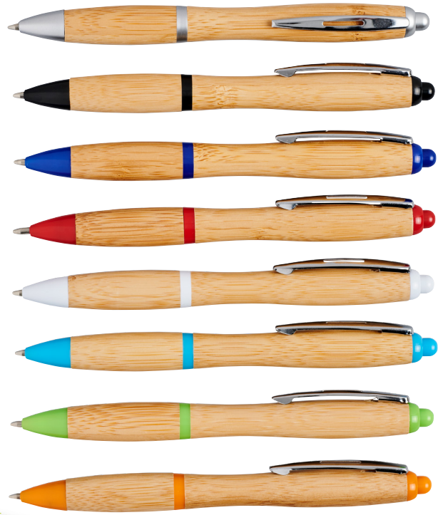
107378 NASH BAMBOO BALLPOINT PEN