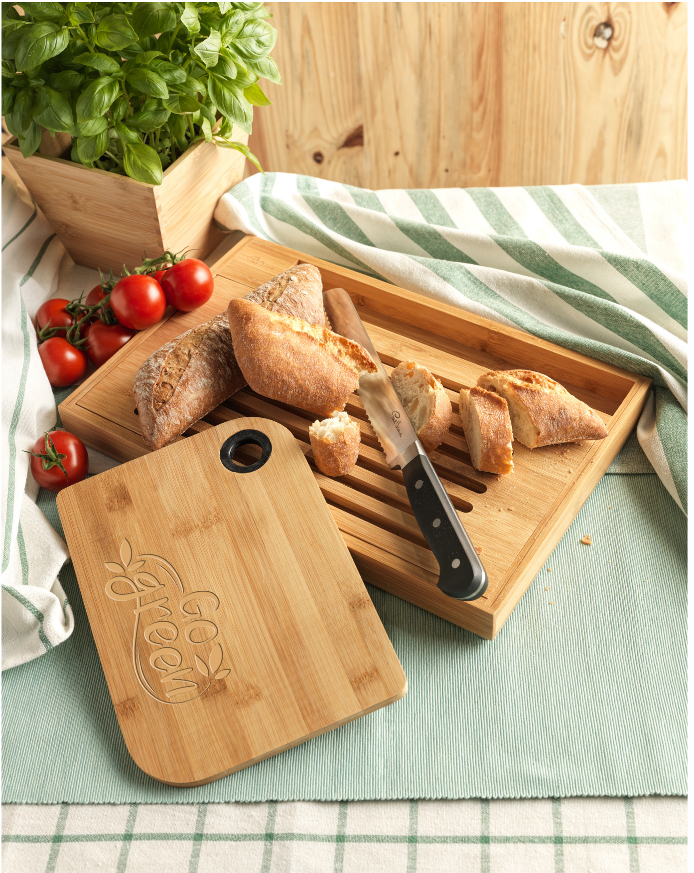
112873 MAIN WOODEN CUTTING BOARD