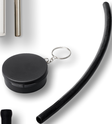
100573 RHINE REUSABLE SILICONE STRAW KEY- CHAIN