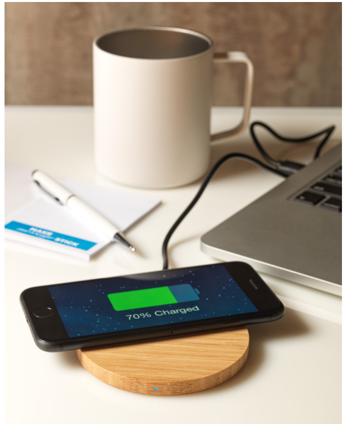
124105 ESSENCE BAMBOO WIRELESS CHARGING PAD