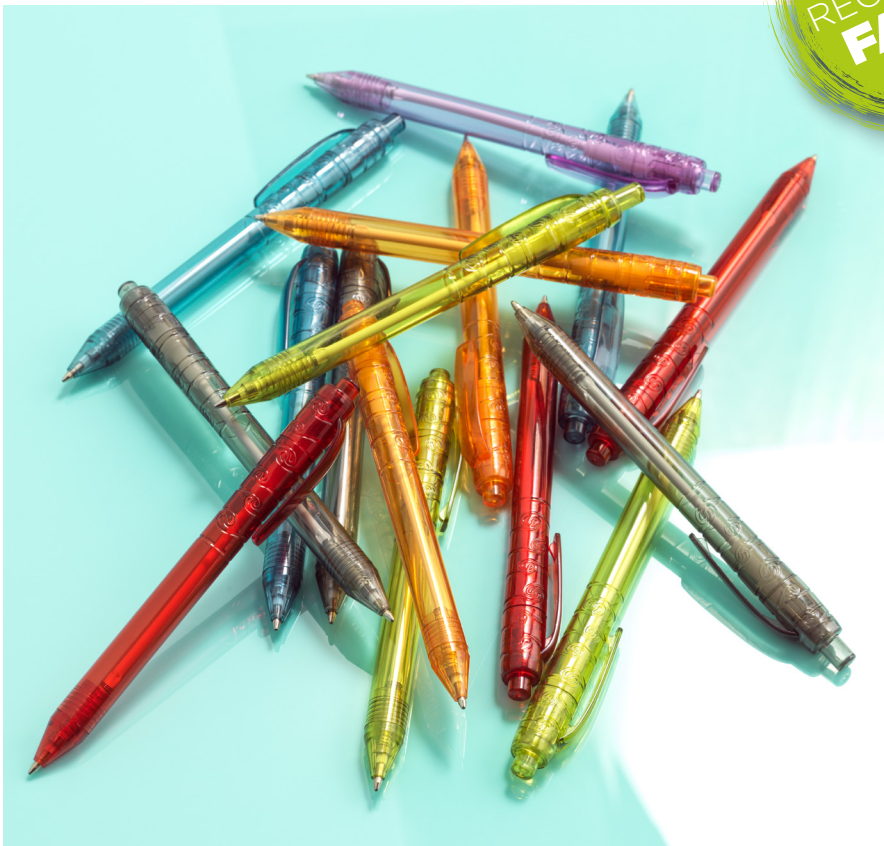
106578 VANCOUVER RECYCLED PET BALLPOINT PEN