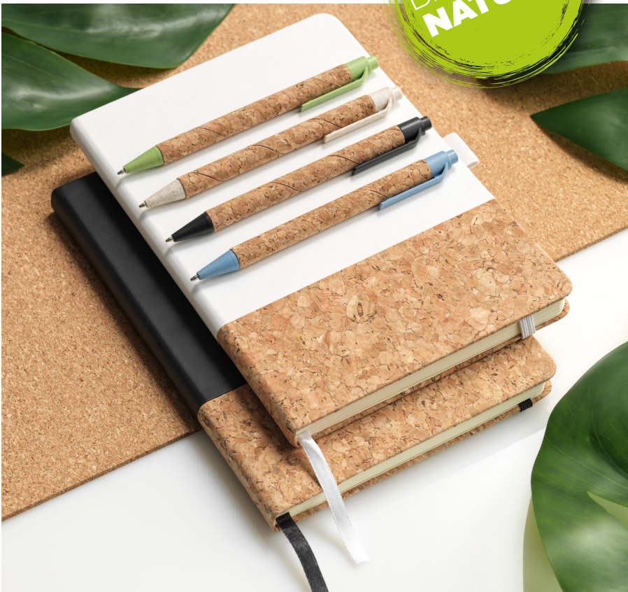
107385 MIDAR CORK AND WHEAT STRAW BALLPOINT PEN