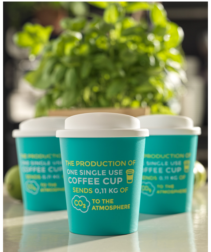
210092 AMERICANO® ESPRESSO 250 ML INSULATED TUMBLER