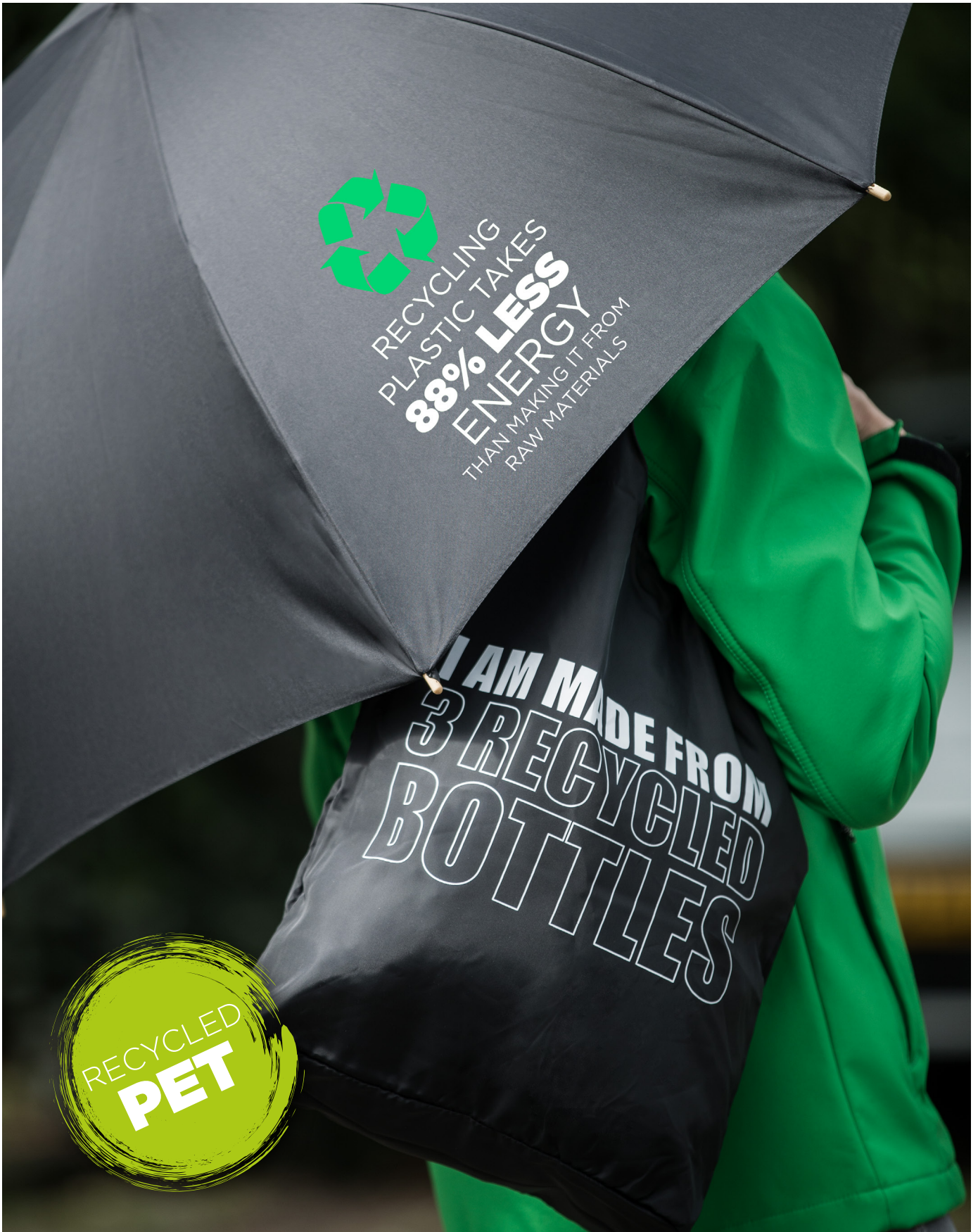
109400 RPET STRAIGHT UMBRELLA