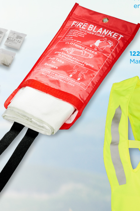
122003 Margrethe emergency fire blanket