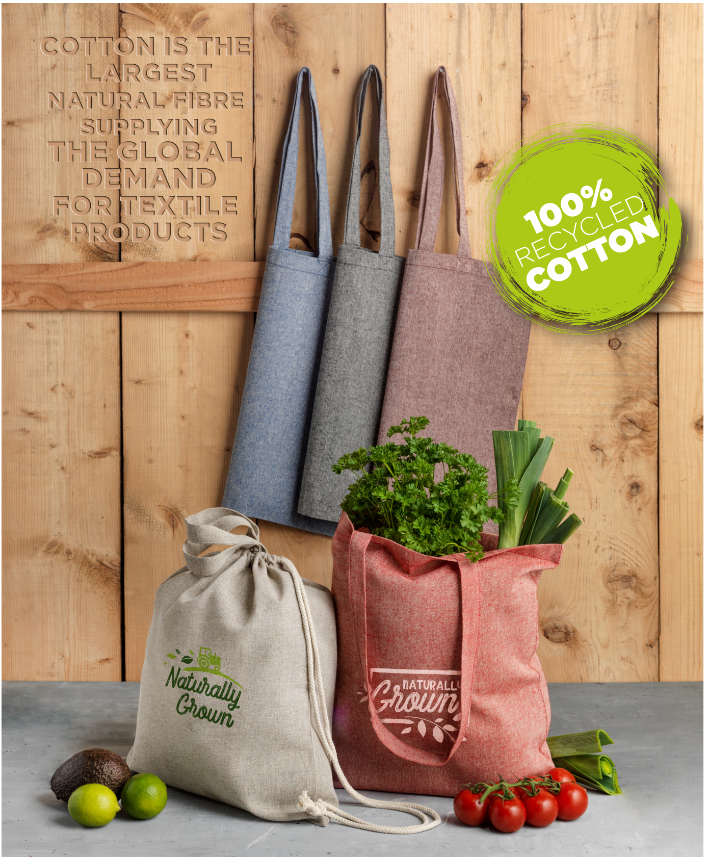
120459 PHEEBS 150 G/M 2 RECYCLED COTTON DRAWSTRING BAG