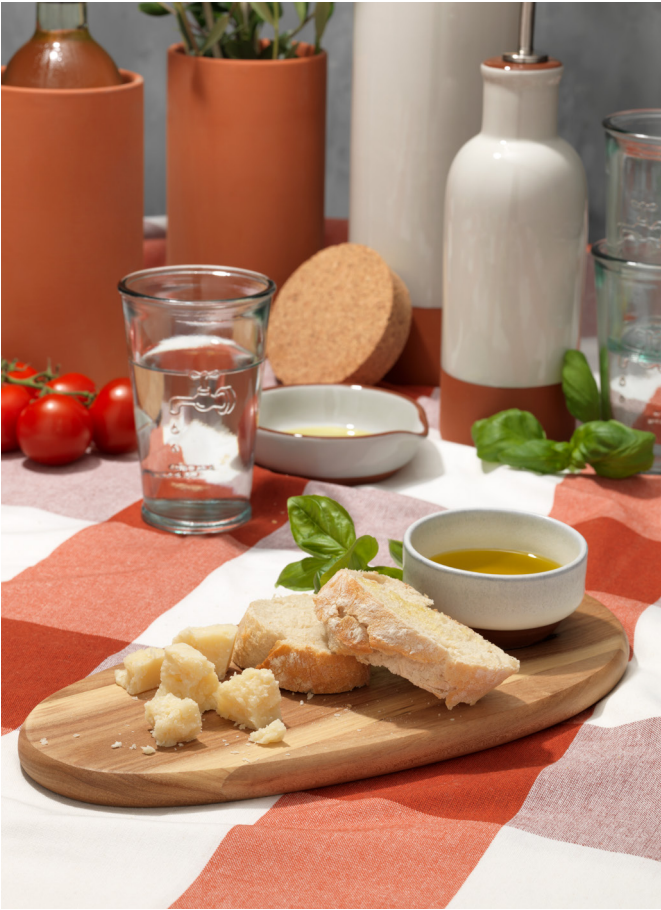
112974 BOLTON BRUSCHETTA SERVING BOARD