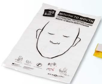
122010 Henrik mouth-to-mouth shield in polyester pouch