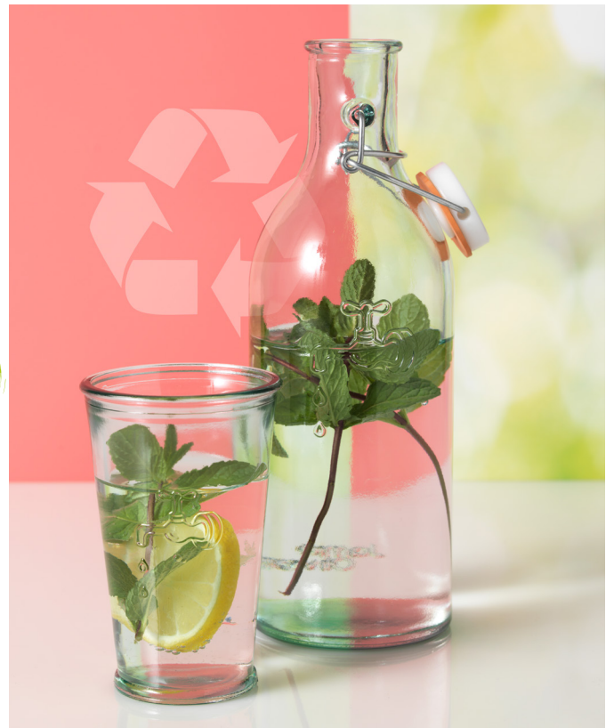
112271 RECYCLED CARAFE WITH GLASS