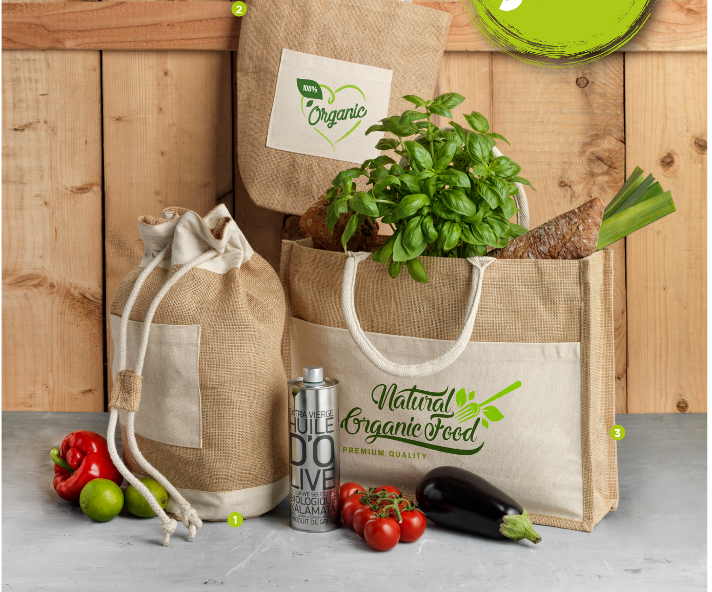
1 119754 GOA JUTE SAILOR BAG