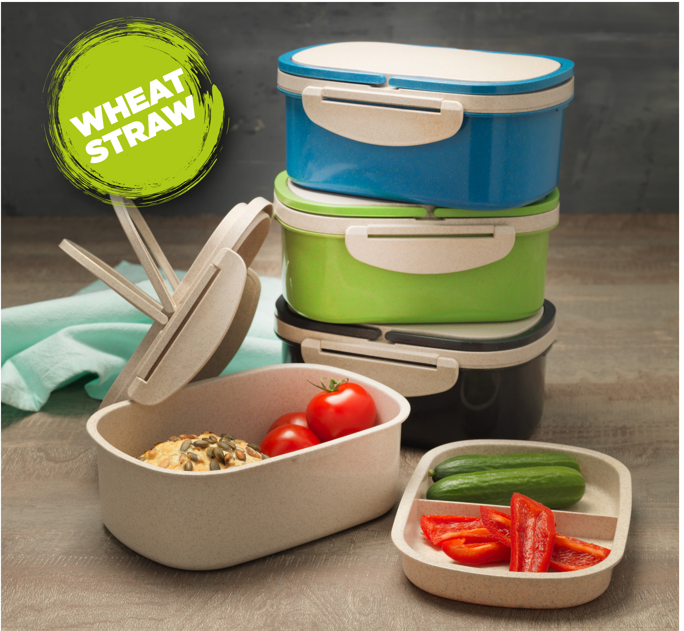
112994 CRAVE WHEAT STRAW LUNCHBOX